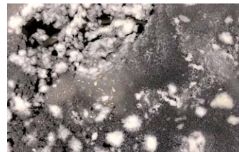
A1: Standard resveratrol behaving as a single agglomerated large particle.

Increasing absorption addresses resveratrol's normally limited ability to dissolve in aqueous environments like the stomach, and provides new product format opportunities. Odourless, and with a neutral taste, Veri-Sperse® allows for easy to flavour formulations. Suitable for powder beverages, liquid shots, oral dispersible tablets, and effervescent tablets.